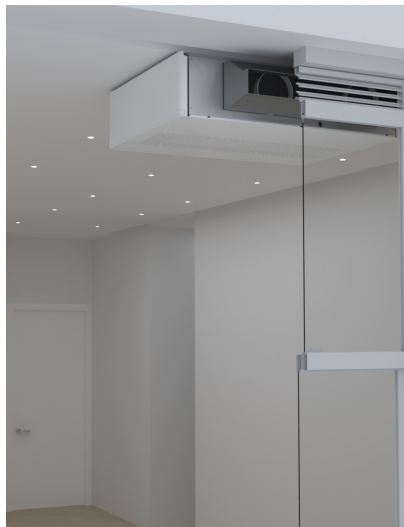
Direct existing window vent