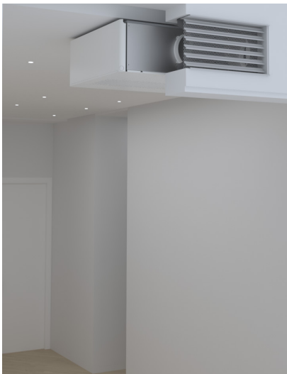
Ducted external vent